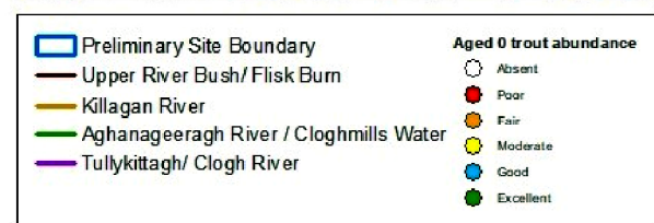
Figure 9.3: Distribution and abundance of Aged 0 trout in DAERA survey sites in 2018 for sub-catchments draining the Site